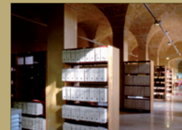
© Sound & Image Archive. Photo: Gabriel Ramon. The Lluís Alemany Library

torical or artistic research. The Lluís Alemany Library collection specializes in subjects related to the Balearics, including the history of art, customs, cartography, religion and science. The library also features an area for small four-monthly exhibitions of its bibliographical and documentary collection.