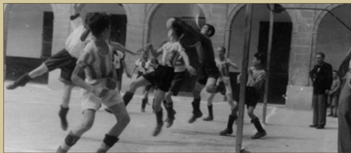
© Consell de Mallorca General Archive, I-77/7. A football match in the men's courtyard.

er for adults (aged 15 to 21) and a third for the elderly (all the rest). When a person was admitted to the poorhouse, they were forced to take a bath and, in the case of the men, to shave their heads. The residents had to wake up at seven o'clock (half past seven in winter), attend mass, and work in the workshops or go to class. The building had shoe, carpentry and printing workshops and a school for boys and girls.