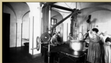
The kitchen of the Casa de la Misericòrdia in around the 1940s.

Thanks to a regulation published in 1946, we can gain an idea of what life was like in the Casa de la Misericòrdia for its residents during the post war period. The institution took in orphans and those in need who were unable to look after themselves due to their advanced age or as a result of physical problems. The men were separated from the women, and each of the two sections was subdivided into one for minors (aged 10 to 15), another