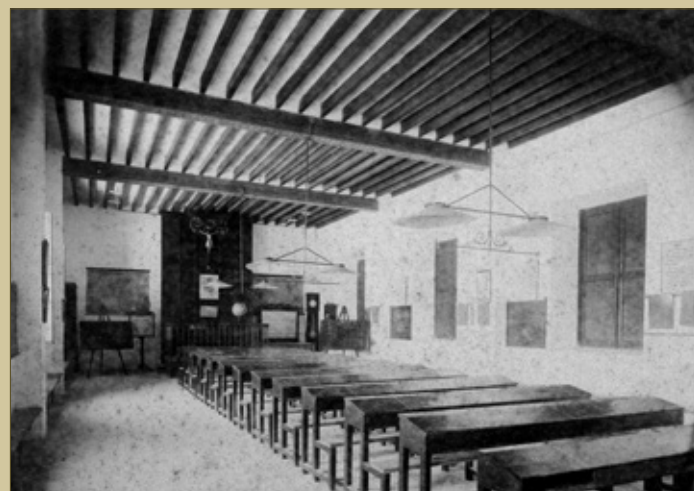
© Consell de Mallorca General Archive, F-1. Classroom of the Casa de la Misericòrdia school.

The building continued to be used as a poorhouse until 1977. Since then it has been run by the Consell de Mallorca, which took it over from the former Provincial Government, and it has been used to house different cultural services and facilities.