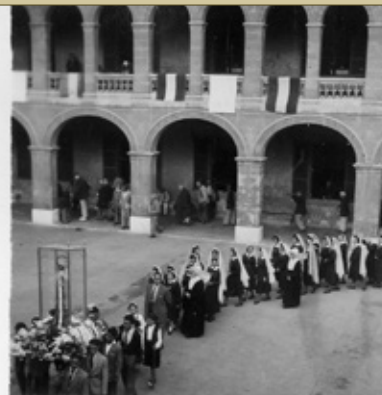
© Consell de Mallorca General Archive, I-77/7. Procession in the men's courtyard in around 1950.

The Casa de la Misericòrdia was a charitable institution founded by the Jesuits in 1565. In 1677, it moved to a large house with a kitchen garden close to the General Hospital. The house must gradually have fallen into a state of disrepair and, as a result, in 1817, master architect Pere Joan Bauçà drew up plans for a new building. The first phase of the building, in the street known today as Carrer de la Misericòrdia, was completed between 1817 and 1845.