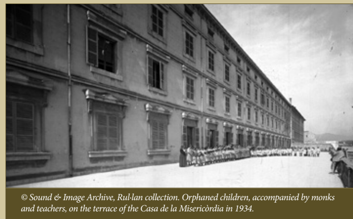
Orphaned children, accompanied by monks and teachers, on the terrace of the Casa de la Misericòrdia in 1934.

In around 1870, a second block was built, destined for the male residents, while the existing part was reserved for the female ones. It is an austere, functional building that stands out for its stark architecture. The dormitories and different workshops could be found on the top floors, while the lower ones housed the administrative offices, storage areas, kitchens, dining rooms and oratory.