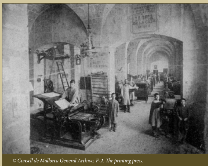
© Consell de Mallorca General Archive, F-2. The printing press.

Except for special occasions, the food consisted of «home-style cooking with no need for frills, sauces or delicacies». At about six o'clock in the evening, the rosary was recited, seven o'clock was supertime, and at nine it was time for bed and silence was kept.